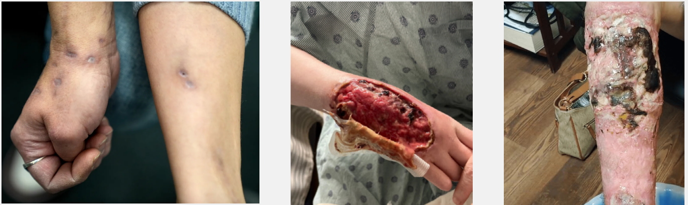
Xylazine associated wounds at various stages of development

Again, because of limitations in testing for xylazine, the association with xylazine and the presence of these wounds is often presumptive and not confirmed by toxicology.